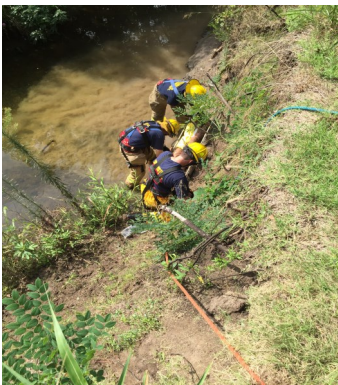
Low Angle Rescue Training

immediately and if not addressed leave the building and contact the local fire department. Does the building appear to be overcrowded? Are there fire sources such as candles burning or heat sources that make you feel unsafe? Are there safety systems in place such as alternative exits, fire sprinklers and smoke alarms? Ask the management for clarification on your concerns. If you do not feel safe in the building, leave immediately.