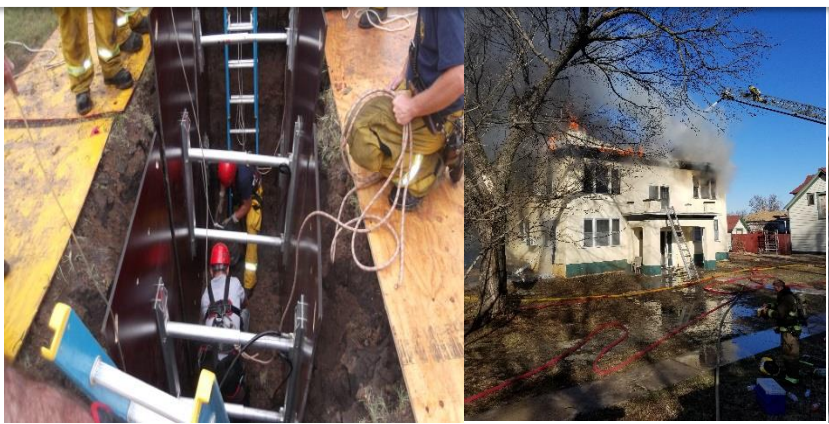
Original Document 2017